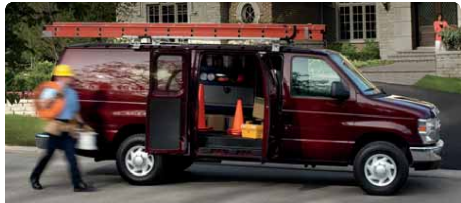
E-250 Extended Length Cargo Van • Royal Red • Optional Equipment: General Contractor Package, Exterior Upgrade Package and QuietFlex<sup>™</sup> III

CONSTANTLY EXPANDING ITS RANGE OF ABILITIES. E-Series Vans provide flexibility to adapt to your trade, capability to do the job, and durability for the long run. Up to 278 cu. ft. of available cargo room features standard double-wall construction to help protect outer body work from shifting loads. As always, E-Series Vans offer you lots of choices: 4 combinations of engine/transmissions, the TorqShift® 5-speed automatic with Tow/Haul Mode<sup>2</sup>, gasoline or diesel power, sliding or swing-out side cargo doors, windows all around or panel sides, no-charge racks and bins packages, and trade-specific upfitter packages. The challenges are out there. E-Series is ready to meet them.