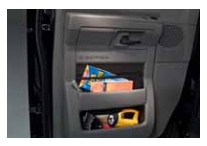
NEW DOOR-TRIM PANELS 2 large bins and an elastic driver-side map strap offer plenty of storage.

<sup>1</sup>TBC verified to be compatible with electric-actuated drum brakes only. <sup>2</sup>Service not available in Alaska or Hawaii. See your Ford Dealer or contact SIRIUS at 1-888-539-7474 for more information. "SIRIUS," the SIRIUS dog logo and "The Best Radio on Radio" are registered trademarks of SIRIUS Satellite Radio Inc.