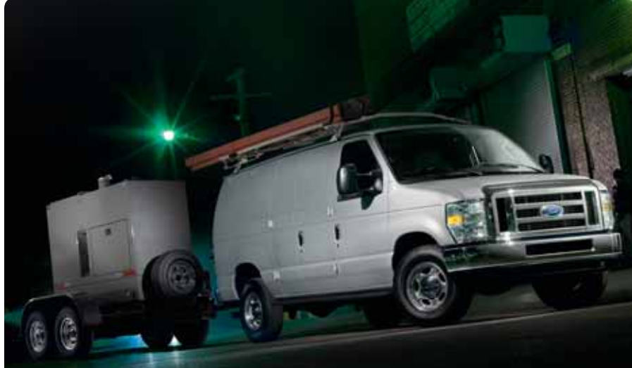
E-250 Cargo Van • Brilliant Silver • Optional Equipment: Exterior Upgrade Package, General Contractor Package, Forged-Aluminum Wheels and Telescoping Trailer Tow Mirrors • Custom Accessories: Platform Running Boards