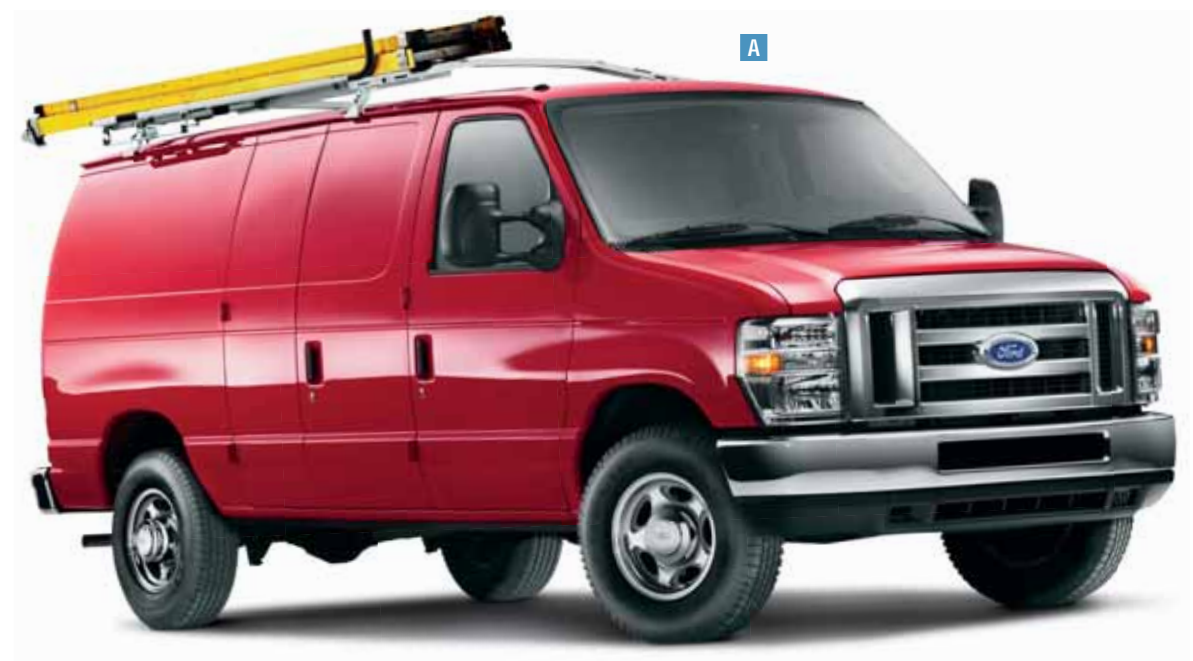
E-250 Cargo Van • Vermillion Red • Optional Equipment: Exterior Upgrade Package, Forged-Aluminum Wheels, Telescoping Power Trailer Tow Mirrors and General Contractor Package