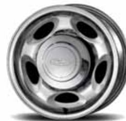
16" Aluminum Available