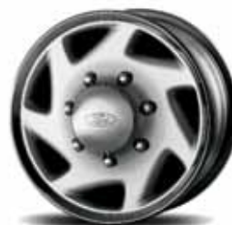
16" Steel with Sport Wheel Covers Standard